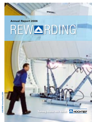
HOCHTIEF annual report 2006 Produced with Smart Connection Enterprise